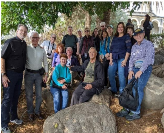
Mt. of Temptations