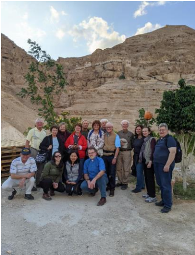
Mt. of Temptations