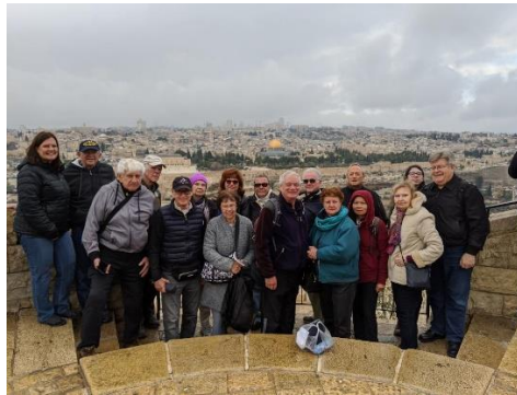
Mt. of Olives in Jerusalem