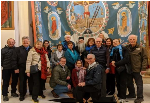
Assyrian Orthodox in Bethlehem

From December 2 nd – 12 th , a group of 17 of us travelled from the Oak Ridge and Berkshire Valley churches to the Holy Land. We had a marvelous time, learned a lot and felt closer to our faith in so many ways. Here are just a few of the photos taken. If you'd like to see more, let someone from the group know, for sure they'd be happy to share their pictures!