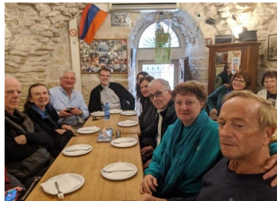
Eating out in Bethlehem