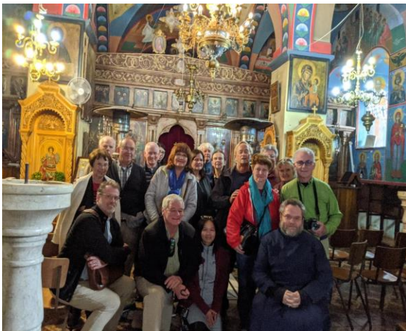
Greek Orthodox Church in Bethlehem