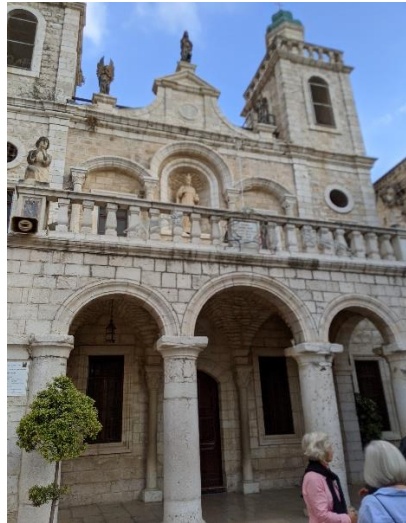
The Wedding Church in Cana